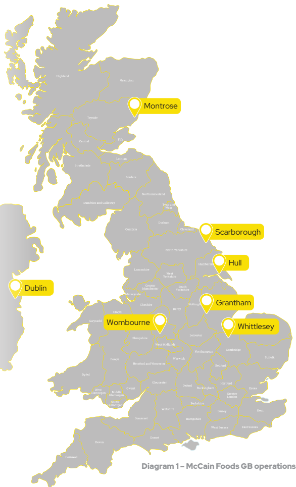
Diagram 1 – McCain Foods GB operations

The supply chain 1 of products and services that contribute to our operations includes raw agricultural materials - the top categories being potato and other commodities, including frying oils and dairy. McCain Foods GB is the largest purchaser of British potatoes and, in FY22, our largest category of spend was on agricultural products and specifically potatoes - procured from 260 contracted suppliers, while other ingredients and raw materials were sourced from 29 suppliers in 12 countries.