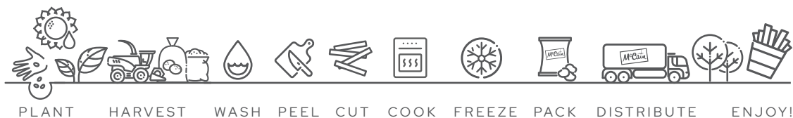
Diagram 2 – McCain Foods GB supply chain